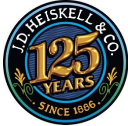
J.D. Heiskell & Company