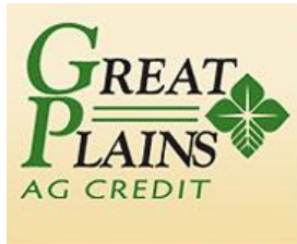
Great Plains Ag Credit