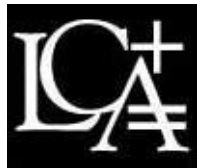
Lovelady, Christy & Associates